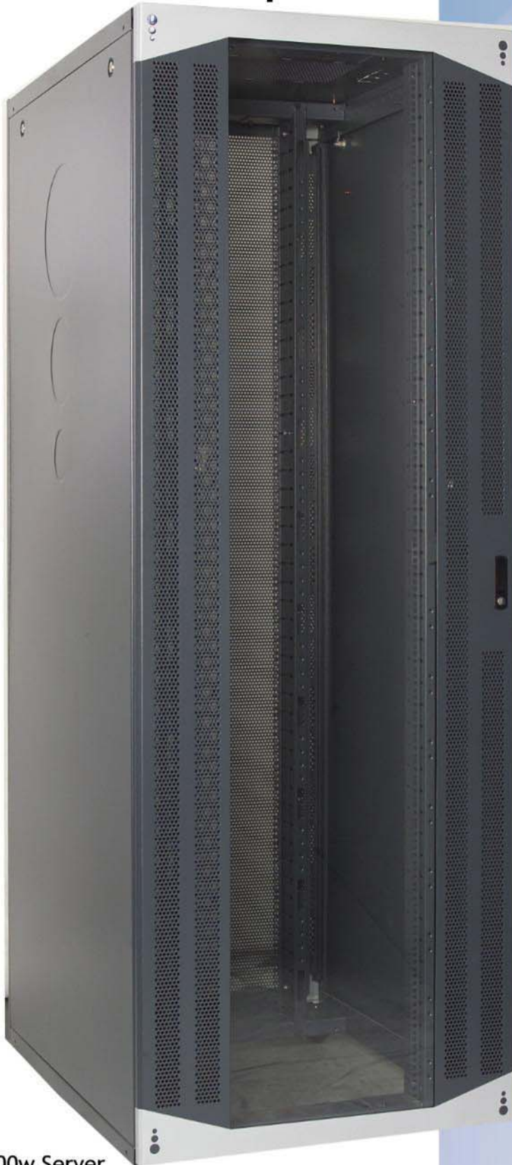
800w Server with Glass AirTech™ Door