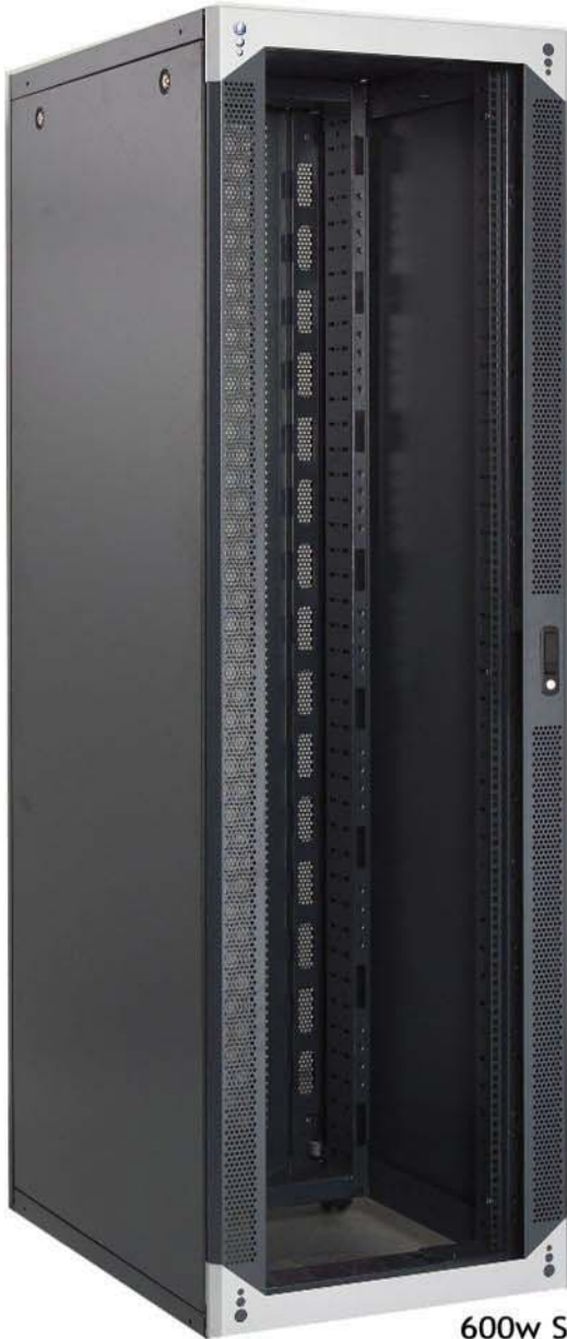
600w Server with glass AirTech™ Door