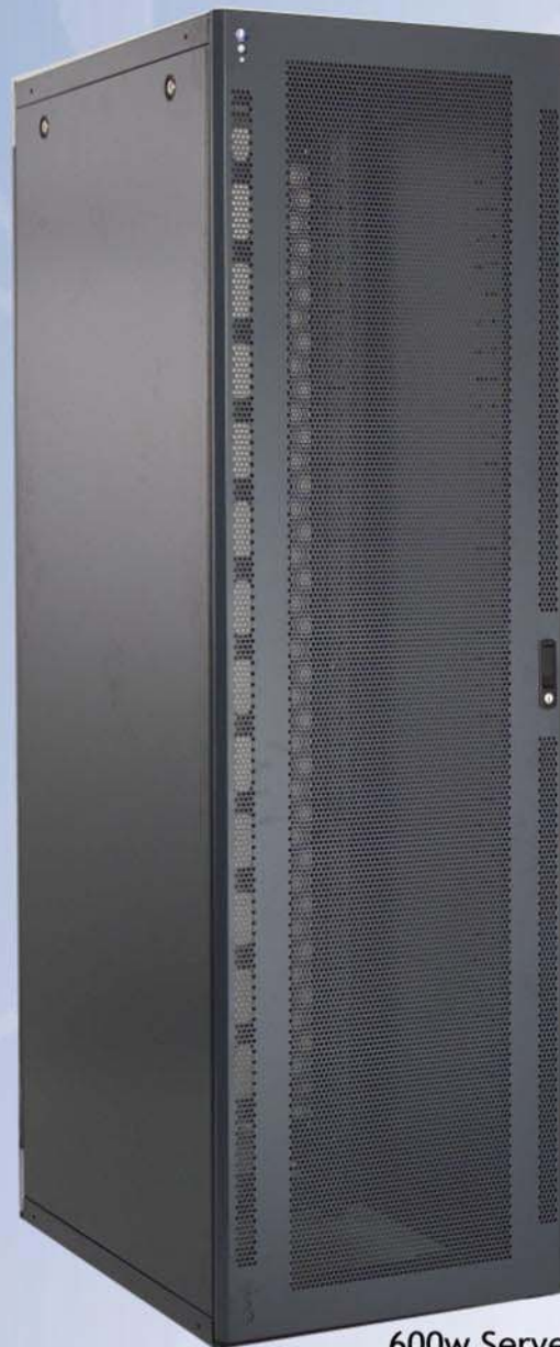
600w Server with Steel AirTech™ Door

AirTech™ is the brand name of USpace vented doors