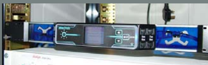
Senturion Normal View with Cable Tidy