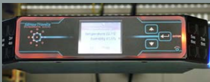
Senturion Red Visible Alarm State

Senturion takes the thinking out of monitoring. This is a plug and play complete solution that will protect your datacentre or computer room equipment from environmental damage. Senturion self-configures and comes with built-in temperature, humidity and light sensors (you can also add up to 8 additional probes) so that it's ready to go in less than 15 minutes, leaving you safe in the knowledge that Senturion will alert you the instant there's a physical threat to your datacentre.