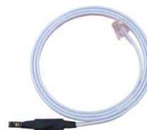
Humid-1Wire 3m 600 279