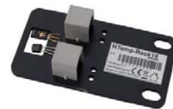
HTemp-Rack19 600 330