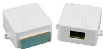
HTemp-1W Box2 600 344