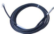
Temp-1Wire-Outdoor 3m 600 311