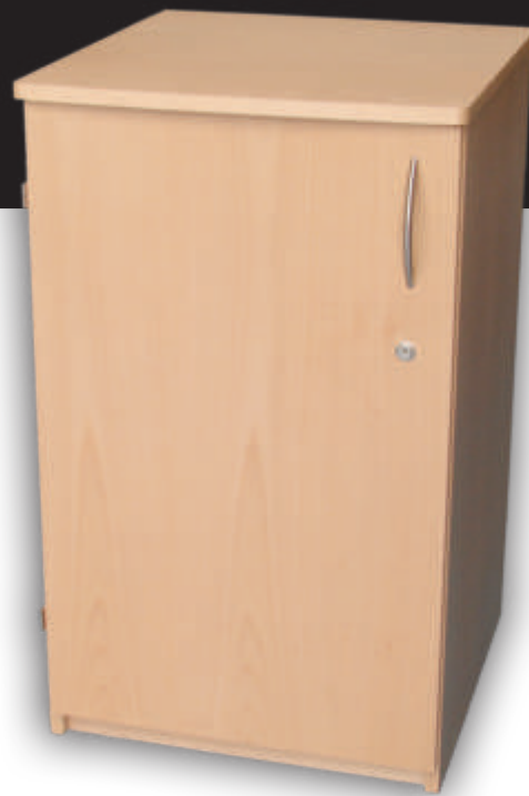
Shown in Beech.

Cupboard door opens 270 degrees for maximum access, as shown in image below.